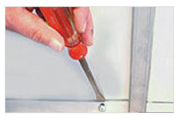
Adjusting Cam Lift door bottom with screwdriver.