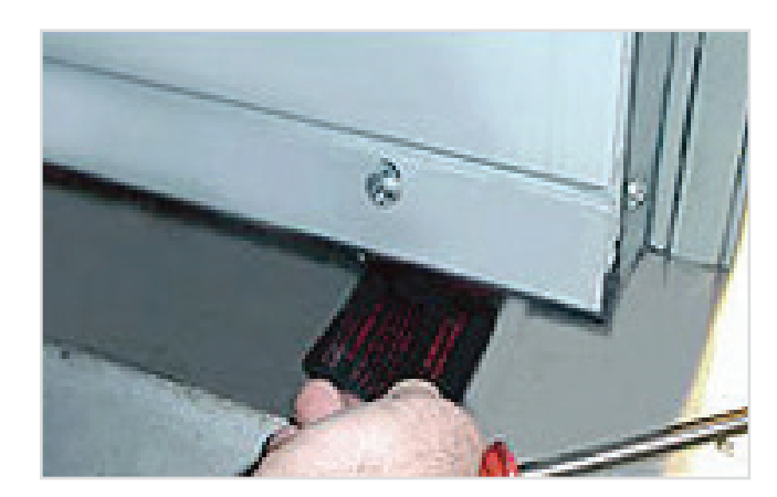
The card should be able to slide in with slight resistance and should stay in place if let go.