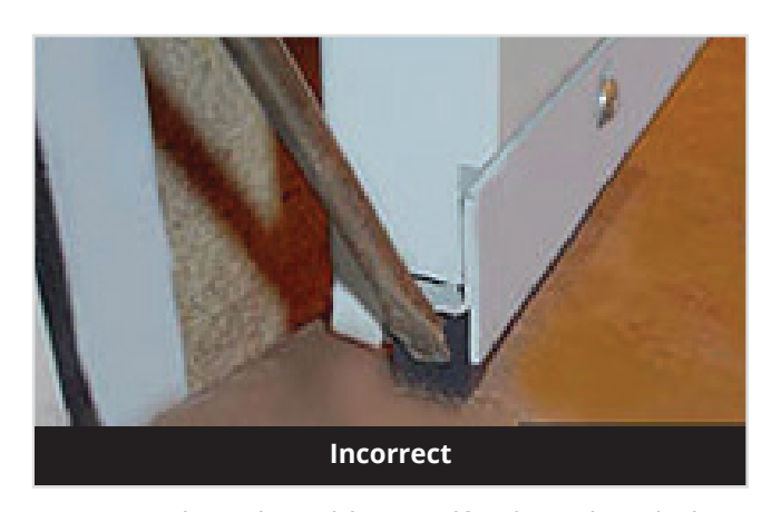
DO NOT adjust the rubber itself; adjust the whole door bottom assembly.