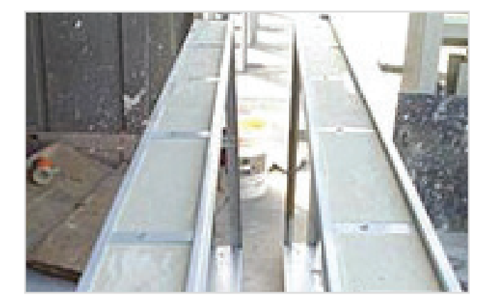
The dried grout should be smooth and flush with the frame.