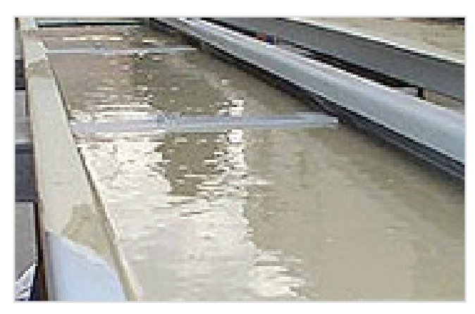
This shows the frame fully grouted. The grout is still wet. Notice that the level of the grout should be fairly even throughout the length of the frame. The level should not be any higher than the returns of the frame.