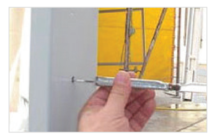
Adjust the pressure anchors.

The pressure anchors, if used, need to be adjusted with a Phillips-head screwdriver so that the pressure anchor becomes flush with the frame. This is done so that no grout will get between the pressure anchor and the frame. If grout gets behind the pressure anchor, it will be very difficult to adjust in order to place the frame into the rough opening.