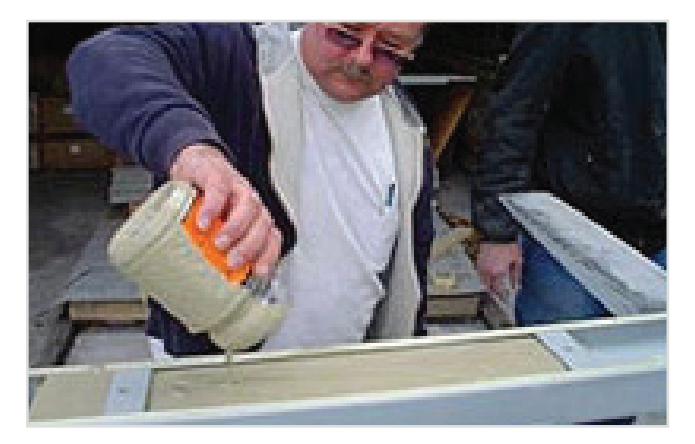
It is easier to top off the level of the grout using a smaller container.