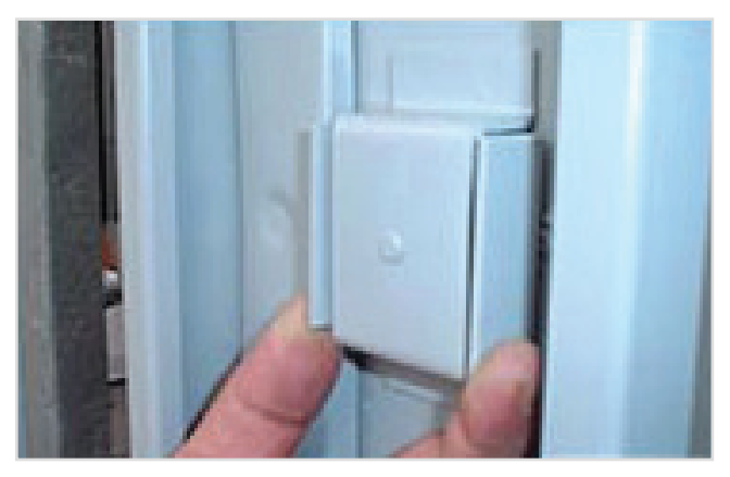
A properly adjusted pressure anchor is flush with the side of the frame.