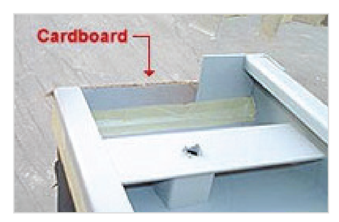
Cardboard: The ends of the frame should be taped up to prevent the grout from spilling out. It is best to cut a piece of cardboard and tape it to both ends of the frame.