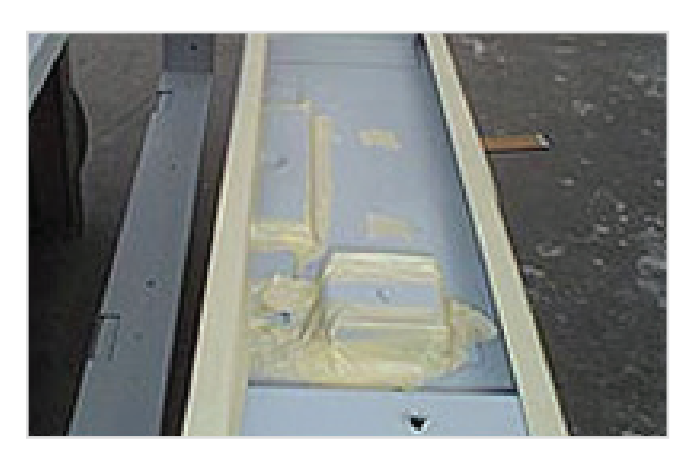
Taping up the edges of the returns will help with cleanup after the grout has dried. A well-prepped frame should look like this.