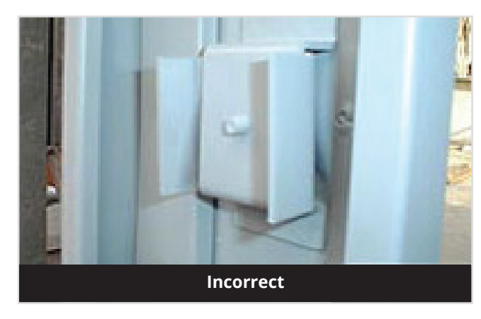
The pressure anchor has not been properly adjusted if the adjusting screw has not been loosened in order to move the pressure anchor back against the frame.