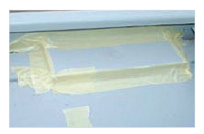
A properly taped pressure anchor has tape all the way around.