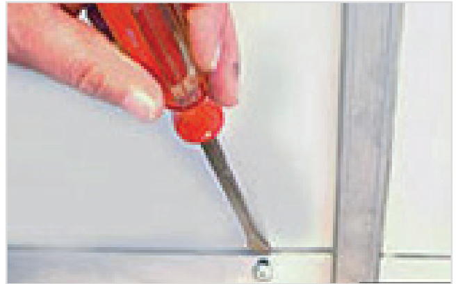
Adjusting Cam Lift door bottom with screwdriver.